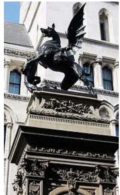
A statue of a heraldic dragon tops the present-day Temple Bar marker in front of the Royal Courts of Justice.

While ostensibly the power of the monarchy appears to be diminishing as the Queen voluntarily gives her Commonwealth countries their independence and they become republics chartered to the United Nations, and she actively works toward abolishing the sovereignty of Britain as the UK is broken up and divided into regions of the European Union her City of London Corporation multi-national banks and corporations are quietly taking over the world.