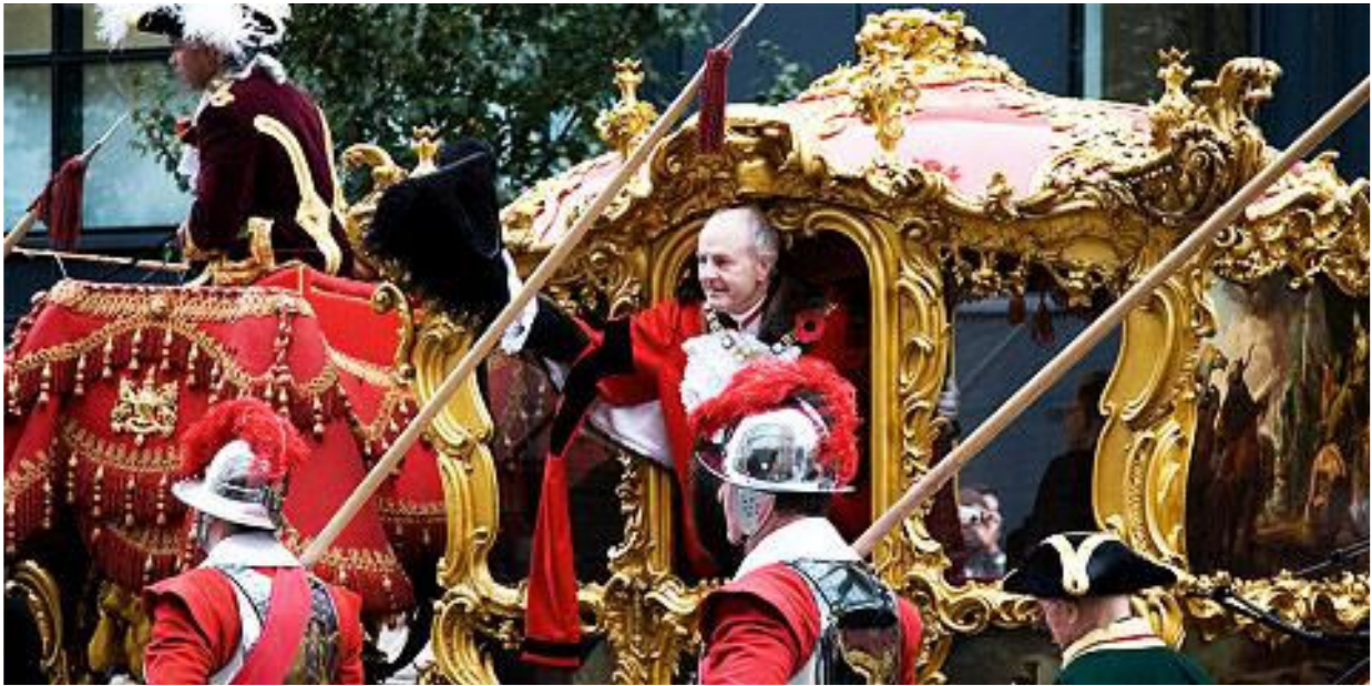
The Lord Mayor 2006

As the result of a 'gentleman's agreement' between the sovereign and the City merchants and bankers made many hundreds of years ago, the Lord Mayor is officially head of the Corporation and is allowed to operate independently of the sovereign. However, the wealth of the world held in the Corporation ultimately is the Sovereign's, because, should the gentleman's agreement break down, the sovereign has the power to "rescind" the Corporation's independence.