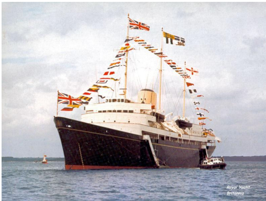
The Royal Yacht Britannia .

Agenda 21 is an action plan of the United Nations (UN) related to sustainable development and was an outcome of the United Nations Conference on Environment and Development (UNCED) held in Rio De Janeiro, Brazil, in 1992. It is a comprehensive blueprint of action to be taken globally, nationally and locally by organizations of the UN, governments, and major groups in every area in which humans directly affect the environment. The full report is here. [1]